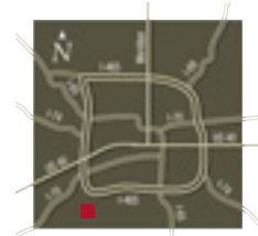
Located on Kentucky Avenue (SR67) and Camby Road South of 465